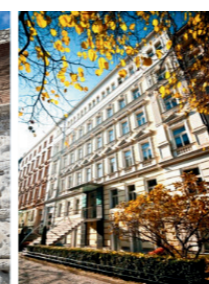
UNIVERSITY OF NEW YORK IN PRAGUE (UNYP) PRAGUE, CZECH REPUBLIC