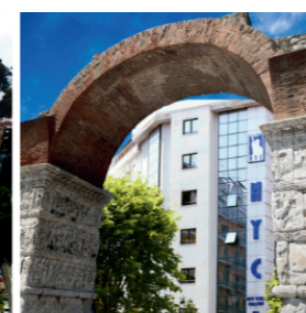
NYC THESSALONIKI CAMPUS THESSALONIKI