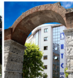
NYC THESSALONIKI CAMPUS THESSALONIKI