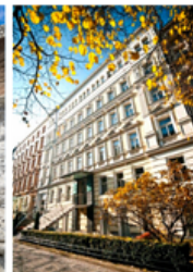
UNIVERSITY OF NEW YORK IN PRAGUE (UNYP) PRAGUE