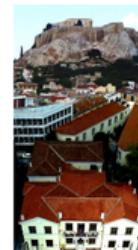
NYC ATHENS CAMPUS ATHENS, SYNTAGMA

Athens: 38 Amalias Ave., Syntagma tel.: +30 210 32 25 961 Thessaloniki: 138 Egnatias & P.P. Germanou tel.: +30 2310 88 98 79 info@nyc.gr, www.nyc.gr