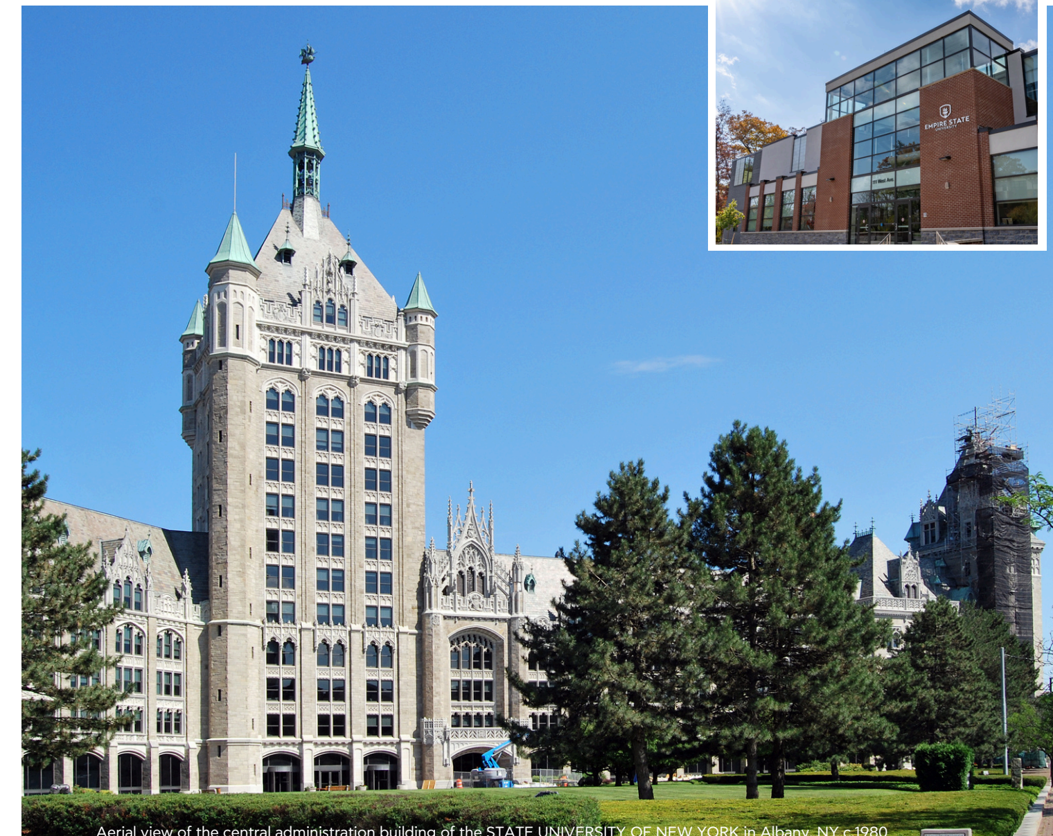
Aerial view of the central administration building of the STATE UNIVERSITY OF NEW YORK in Albany, NY c.1980

New York College has a franchise agreement under the Greek Ministry of Education legislation and the degree you will receive at the end of your studies is awarded by the University itself.