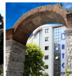
NYC THESSALONIKI CAMPUS THESSALONIKI