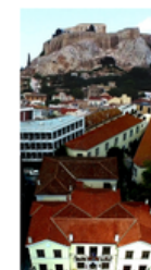
NYC ATHENS CAMPUS ATHENS, SYNTAGMA

Athens: 38 Amalias Ave., Syntagma tel.: +30 210 32 25 961 Thessaloniki: 138 Egnatias & P.P. Germanou tel.: +30 2310 88 98 79 info@nyc.gr, www.nyc.gr