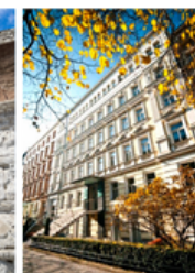
UNIVERSITY OF NEW YORK IN PRAGUE (UNYP) PRAGUE