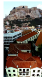
NYC ATHENS CAMPUS ATHENS, SYNTAGMA

Apply Now! Athens: 38 Amalias Ave., Syntagma tel.: +30 210 32 25 961 Thessaloniki: 138 Egnatias & P.P. Germanou tel.: +30 2310 88 98 79 info@nyc.gr , www.nyc.gr