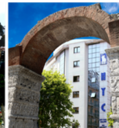
NYC THESSALONIKI CAMPUS THESSALONIKI